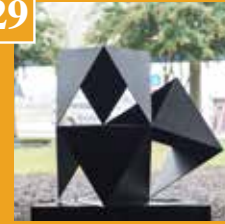
Complementary Geometry 1 Hongsock Lee