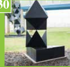
Complementary Geometry 2 Hongsock Lee