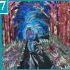
Guardian Angel Sunny Gravely