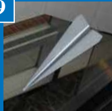
Aluminum Paper Airplanes In Flight Jay Jones