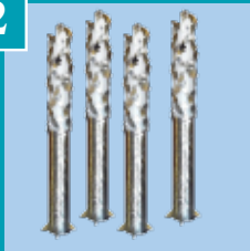
Oak Leaf Light Columns (4) Jim Gallucci