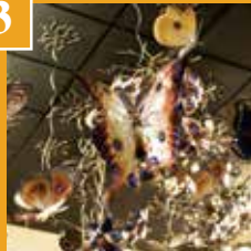
A Traveler's Garden Gary Caldwell and Holly Felice