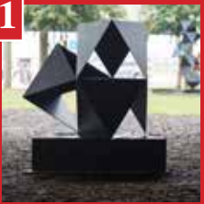
Complementary Geometry 3 Hongsock Lee